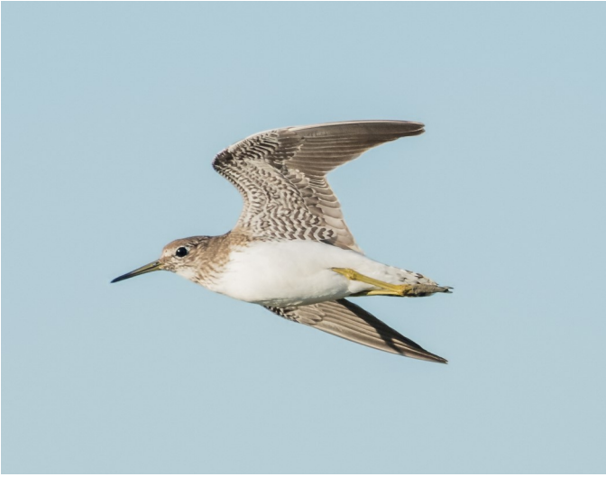
A Solitary Sandpiper ( Tringa solitaria ) was observed on 7 September 2018 at the Yolo Basin Wildlife Area by Dan Brown.