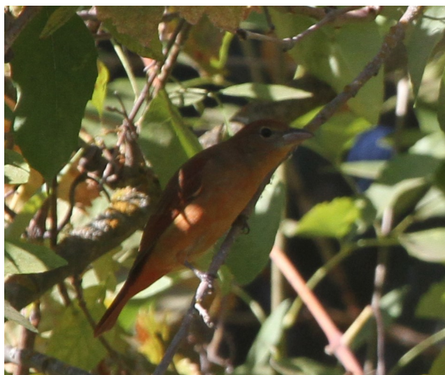
On 18 August 2018 Kirk Swenson discovered a molting male Summer Tanager ( Piranga rubra ) along Putah Creek. This tanager spent its time flying back and forth between both Yolo and Solano Co. through 20 September.