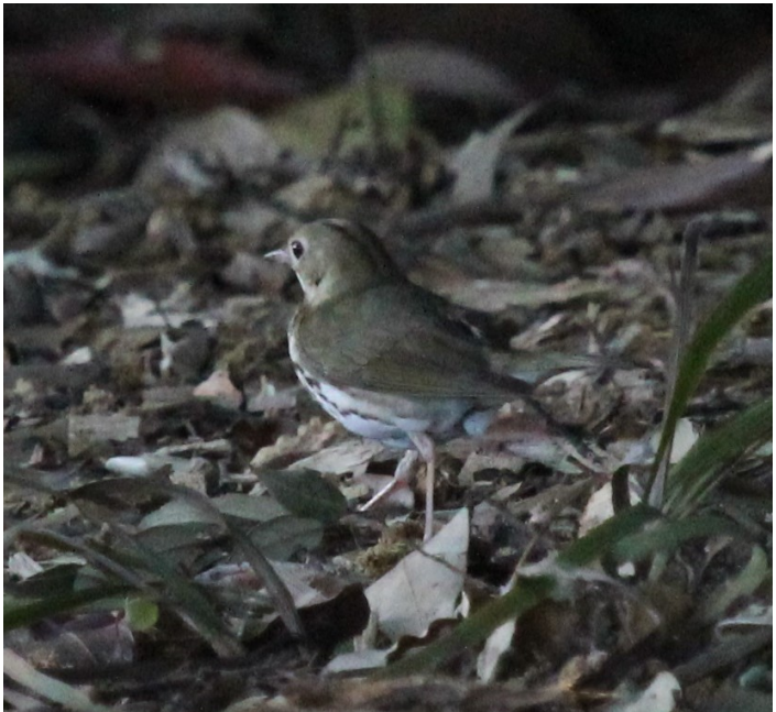
A singing Ovenbird ( Seiurus aurocapilla ) was found by Lyann Comrack on 7 Jun 14 at Land Park Zoo, Sacramento, CA.