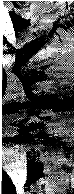
San Joaquin Co., 20 November

pip er on 16 and 17 August (O, JRo) were two Baird's ty record. Two Pectoral derling were at the Fresno ). A Willet at the northern &CL) was perhaps the only species, which is rare in the Lodi Sewage Ponds on 9 and onds on 8 October (DY). A on 15 September (JG, JCS) or the entire Central Valley Stanislaus County that day it of 23 Lesser Yellowlegs, iper (JG). A Ruddy Turn- ent Plant in Yolo County on species inland than the Black it regular locations in Kings ds on 4 September (JK). A