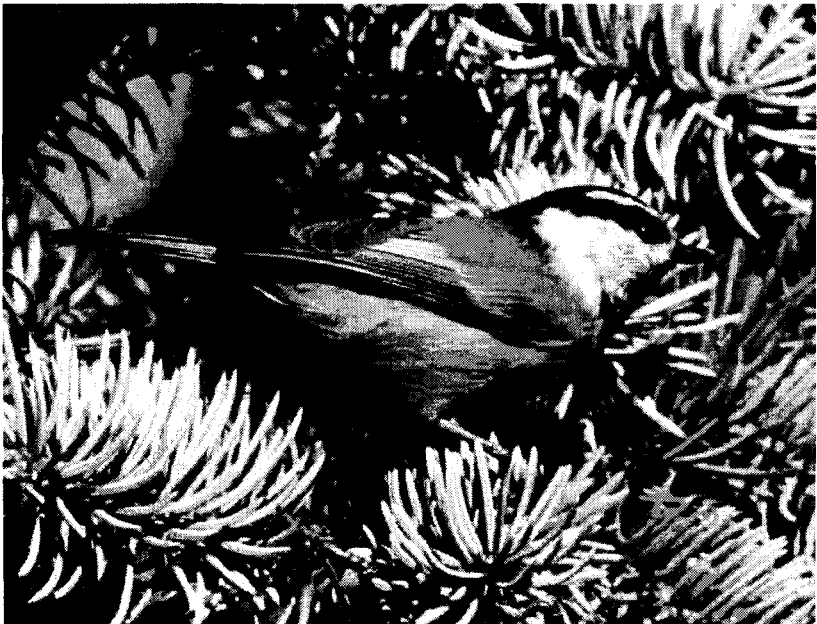
Figure 4. Mountain Chickadee in Davis, Yolo County, 25 November 2005.

A Hammond's Flycatcher at Burris Park in Kings County on 22 November (MSM) and a Western Kingbird near Snelling in Merced County on 4 November (JTz) were very late migrants. Kern County hosted two rare wintering flycatchers: an Eastern Phoebe at the Tule Elk Preserve first found on 14 November (BM), and a male Vermilion Flycatcher at the Kern NWR in Kern County discovered on 22 October (D&KM). Another Eastern Phoebe put in a brief showing at UC Davis on 7 October (BBE). Hot on the heels of the summer's Least Bell's Vireo records, a molting bird was found in the riparian vegetation below Lake Success on 15 September (SS) for the first Tulare County record, and one of few recent records for the species in the entire Central Valley. A male and female Purple Martin at the Gustine Sewage Ponds on 23 September (AD) was a rare record of a migrant on the valley floor and one of few records for Merced County. The Mountain Chickadee at Slide Hill Park in Davis on 23 November (MP+) was the first record in Yolo County in 24 years and one of very few on the valley floor in the past decade. A Sage Thrasher on Pyramid Hills Road in Kings County on 26 September (JLx, FO) was in a location and habitat where one would expect to find this species during migration.