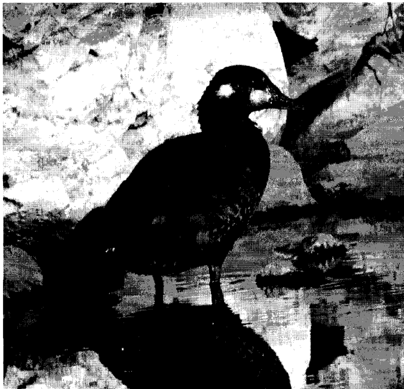
Figure 2. Harlequin Duck, Stockton Sewage Ponds, San Joaquin Co., 20 November 2005.

three Solitary Sandpipers and a Baird's Sandpiper on 16 and 17 August (JLa). Nearby in District 10 on 18 August (FO, JRo) were two Baird's Sandpipers , for an overdue first Yuba County record. Two Pectoral Sandpipers , one Baird's Sandpiper and a Sanderling were at the Fresno Sewage Treatment Plant on 13 August (BB, LH). A Willet at the northern end of Black Butte Reservoir on 9 September (L&CL) was perhaps the only the second record for Tehama County of this species, which is rare in the Sacramento Valley. Red Knots appeared at the Lodi Sewage Ponds on 9 and 18 September (KM), and the Stockton Sewage Ponds on 8 October (DY). A Black Turnstone at the Modesto Sewage Ponds on 15 September (JG, JCS) was a first for Stanislaus County and one of few for the entire Central Valley of this coastal species. Other shorebirds seen in Stanislaus County that day at the Ceres Sewage Ponds included a high count of 23 Lesser Yellowlegs , 2 Pectoral Sandpipers and one Solitary Sandpiper (JG). A Ruddy Turnstone was at the Woodland Wastewater Treatment Plant in Yolo County on 4 Aug (RH, JH). It is a rare, but more regular species inland than the Black Turnstone. The only Stilt Sandpiper away from its regular locations in Kings and Kern counties was one at the Davis Wetlands on 4 September (JK). A