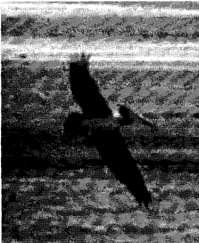
Figure 1. Brown Pelican, Lake Success, Tulare Co., 15 September 2005.

At Lake Success from 15-24 September, an immature Brown Pelican was present for a first Tulare County record (SS, JLx). Two Least Bitterns at the Consumnes River Preserve on 22 November (JT) were in an area from which there are increasing numbers of records in recent years. This species is known to occasionally winter in the Central Valley, but the extent of this