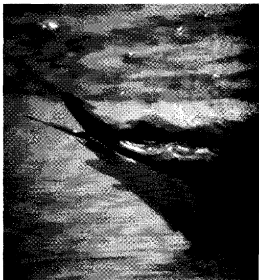
Figure 3. Sabine's Gull at Stoil Ponds, Tulare Co

A Western Gull in Redding, Shasta Count ber (BD) may have been the same one that wint is becoming one of the more regular inland local species. However, one at the Corcoran Ponds i