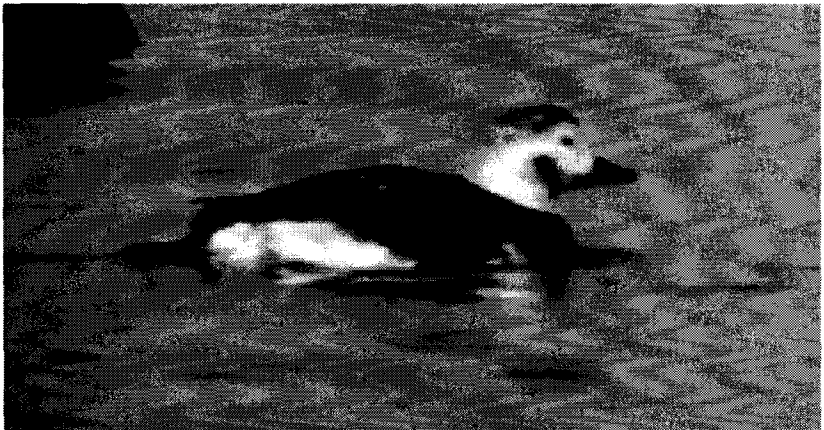
Figure 1. Long-tailed Duck at O'Neill Forebay, Merced Co., 21 December 2004.