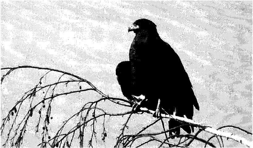
Figure 2. Common Black Hawk at North Lake, Stockton, San Joaquin Co., 28 January 2005.

A Stilt Sandpiper found at the Merced NWR on 6 February (LCh) and 14 February (JG) was at a location where the species has wintered in recent years. An adult Western Gull at Kutras Lake on 3 December (RS) that remained to mid-February was at a location in Shasta County where that species and other rare gulls are becoming somewhat regular in winter. Another adult Western Gull photographed at Delevan NWR on 19 February (L&CL) was a first record for Colusa County. A first-year Thayer's Gull at the Nevada Avenue Pond on 4 December (SG) and another along 6 th Avenue on 17 January (JS) were two of few records of this species for Kings County. Five Thayer's Gulls were also nearby in southern Fresno County, attracted to a landfill on American Road on 14 December (JD). This species may prove to be more regular in the lower San Joaquin Valley than previously thought. A Mew Gull wandered north to Oroville at the Feather River Fish Hatchery on 5 December (BD). In the Central Valley, this species is primary found in the vicinity of the Delta, Sacramento and Davis. Another Mew Gull at Buena Vista Lake on 3 February (ML) was in Kern County where this species very rare.