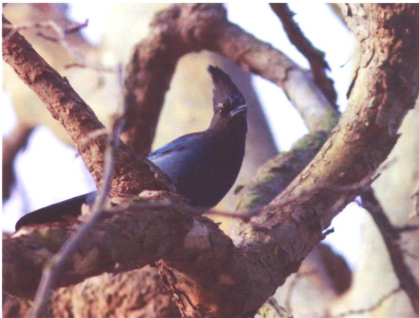
Figure 6. Steller's Jay ( Cyanocitta stelleri ) is a very rare winter visitor to the valley floor. This bird was photographed in Sacramento, Sacramento County, in December 2010.