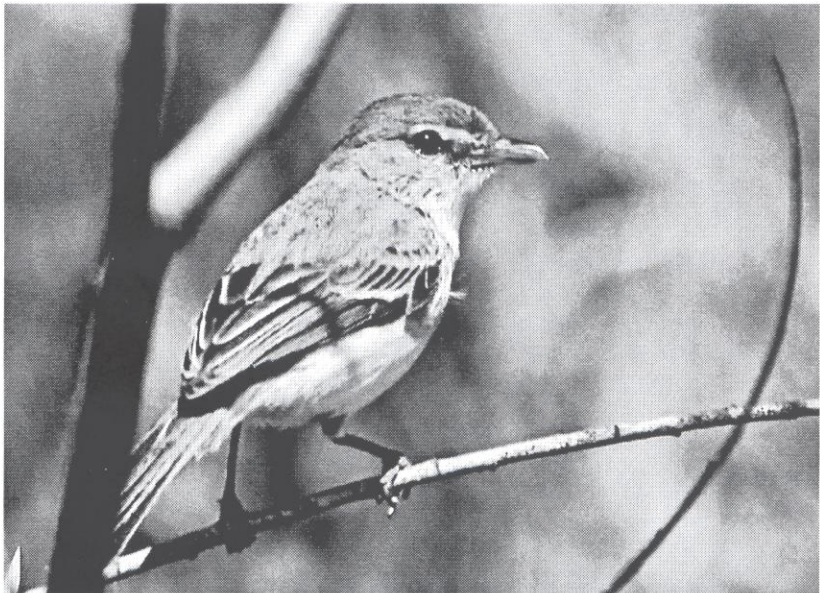
Figure 11. Least Bell's Vireo ( Vireo bellii pusillus ) was extirpated from the Central Valley, but has been making a comeback in recent years. This singing male, photographed on 16 April 2010, was one of 3-4 birds found at the Yolo Bypass Wildlife Area, Yolo County, through the summer.