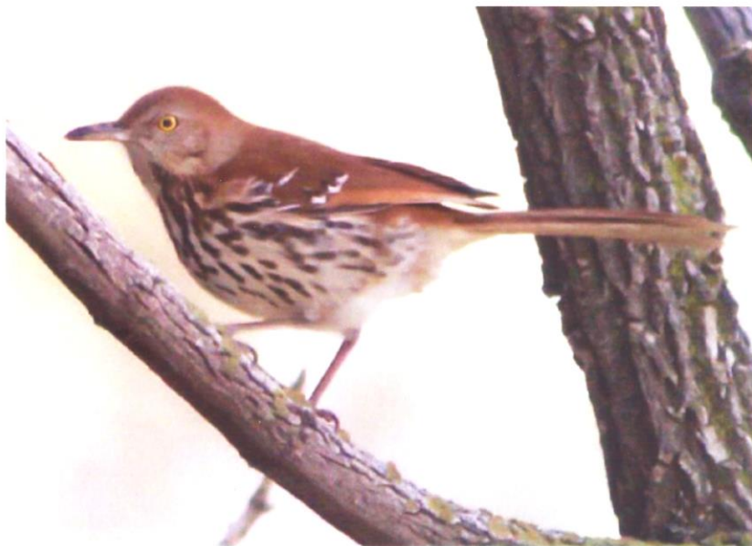
Figure 7. A rare vagrant from the east, this Brown Thrasher ( Toxostoma rufum ), photographed on 14 January 2010, wintered at Noon Park near Buena Vista Lake, Kern County.