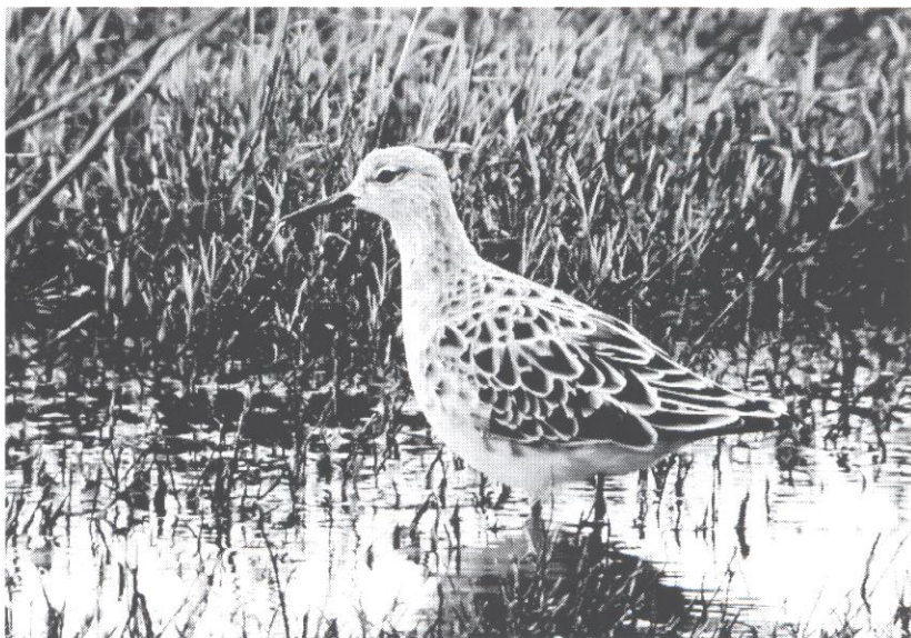
Figure 10. The Ruff ( Philomachus pugnax ) is a rare Siberian vagrant found annually in the Central Valley. Most records for California are during fall migration, but the Central Valley gets 1-3 each winter. This reeve (female Ruff) was photographed at the Yolo Bypass Wildlife Area, Yolo County, in March 2010.