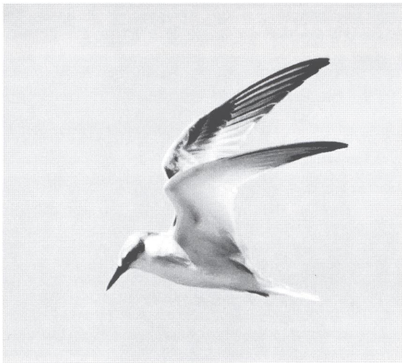
Figure 13. Least Terns ( Sternula antillarum ) have bred in the past two years at the Sacramento County Bufferlands, where this juvenile was foraging on 17 August 2010.