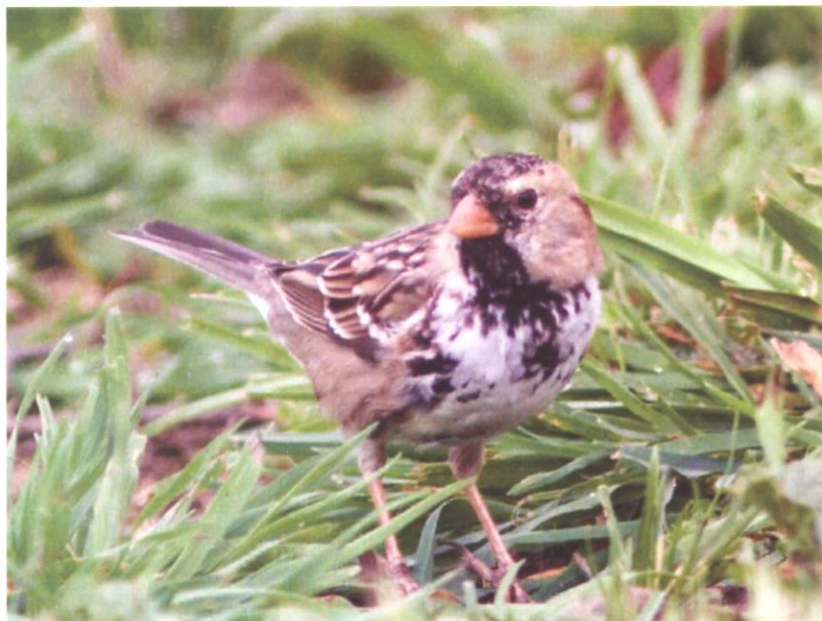
Figure 9. Harris's Sparrow ( Zonotrichia querula ) is a rare winter visitor to the Central Valley. This bird was photographed in Redding, Shasta County, on 25 March 2010.