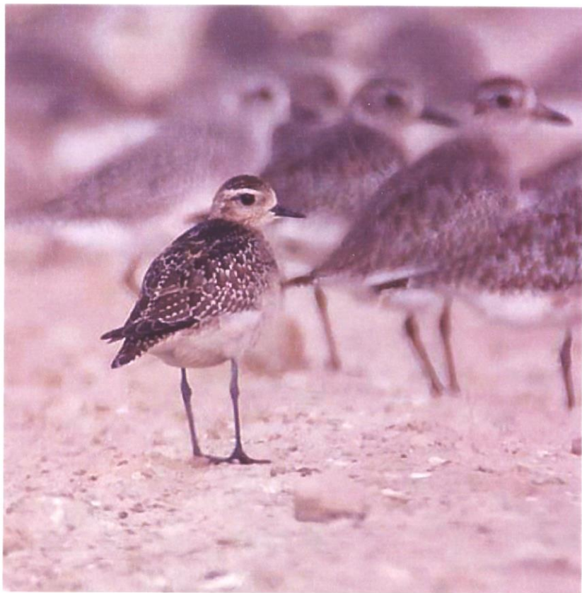
Figure 3. This American Golden-Plover ( Pluvialis dominica ), photographed against a backdrop of Black-bellied Plovers ( Pluvialis squatarola ) at the Fresno Wastewater Treatment Plant on 19 November 2010, established the first documented record for Fresno County. Clearly visible in this photo is the longer primary extension in the folded wing of this species (as compared to the shorter-winged Pacific Golden-Plover [ P. fulva ]), with four primary tips extending beyond the tertials.

We here present our annual selection of photos of some of the rare bird highlights of the past year. We'd like to encourage as many Central Valley bird photographers as possible to submit their photos of rarities encountered in the coming months for possible use in this feature in 2011. Please send photographs to the photo editor, Dan Brown (see the inside front cover for the address).