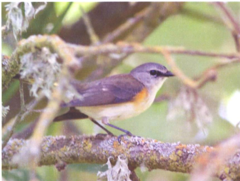
Figure 8. American Redstart ( Setophaga ruticilla ) is a rare visitor to the Central Valley. This first-year male was singing in southern Yolo County on 5 June 2010.