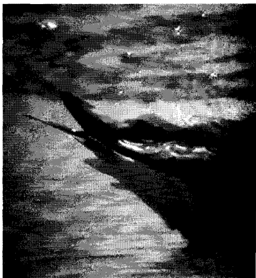
Figure 3. Sabine's Gull at Stoil Ponds, Tulare Co

A Western Gull in Redding, Shasta Count ber (BD) may have been the same one that wint is becoming one of the more regular inland local species. However, one at the Corcoran Ponds i