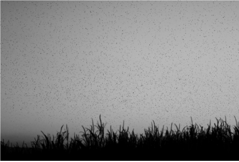
Figure 2. Tree Swallows ( Tachycineta bicolor ) returning to the Wright Road corn field roost near Tracy, San Joaquin Co., on 24 October 2008.